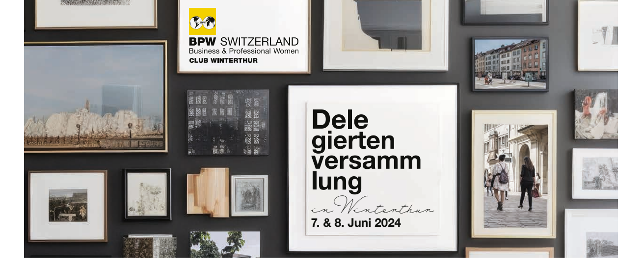
KULTUR | TECHNIK | WISSEN begleiten uns durch die DV24