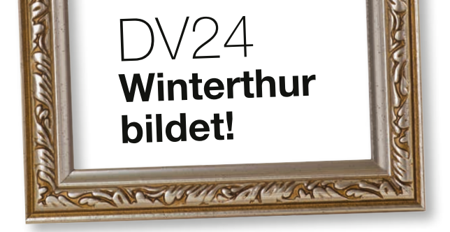
KULTUR | TECHNIK | WISSEN begleiten uns durch die DV24